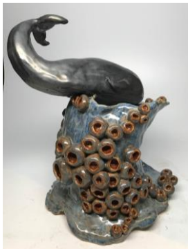
3D 1 st : "Ride the Wave" Cammie Dunn