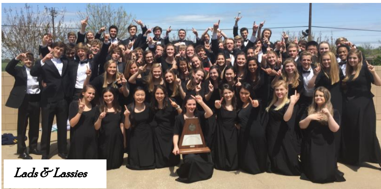
Lads & Lassies