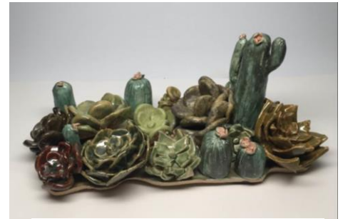
3D 3 rd : "Cacti" - Ava Olivo