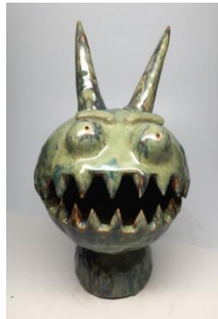
3D 2 nd : "Monster" Caleb Kimzey