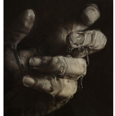
"Drips" - Gretchen Kupferschmid