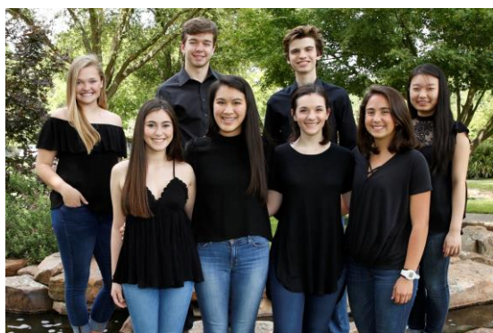
2017-18 Lads and Lassies Officers: