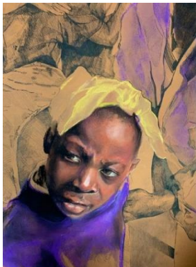
Mulibwanji | chalk pastel, charcoal, micron pen, toned paper. Cross-hatching, shading, smudging, cropped initial drawing to stress personal nature of turmoil

View Claire's actual exhibit page on the College Board website at: