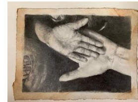
This is Going to be Mine Graphite pencils, white drawing paper, ink pad. Hand deckled edges, studied/recreated

https://2020artanddesignexhibit.collegeboard.org/claire-cochran