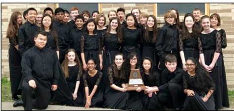
HPMS Honor Orchestra