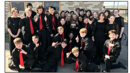
HPMS Concert Orchestra